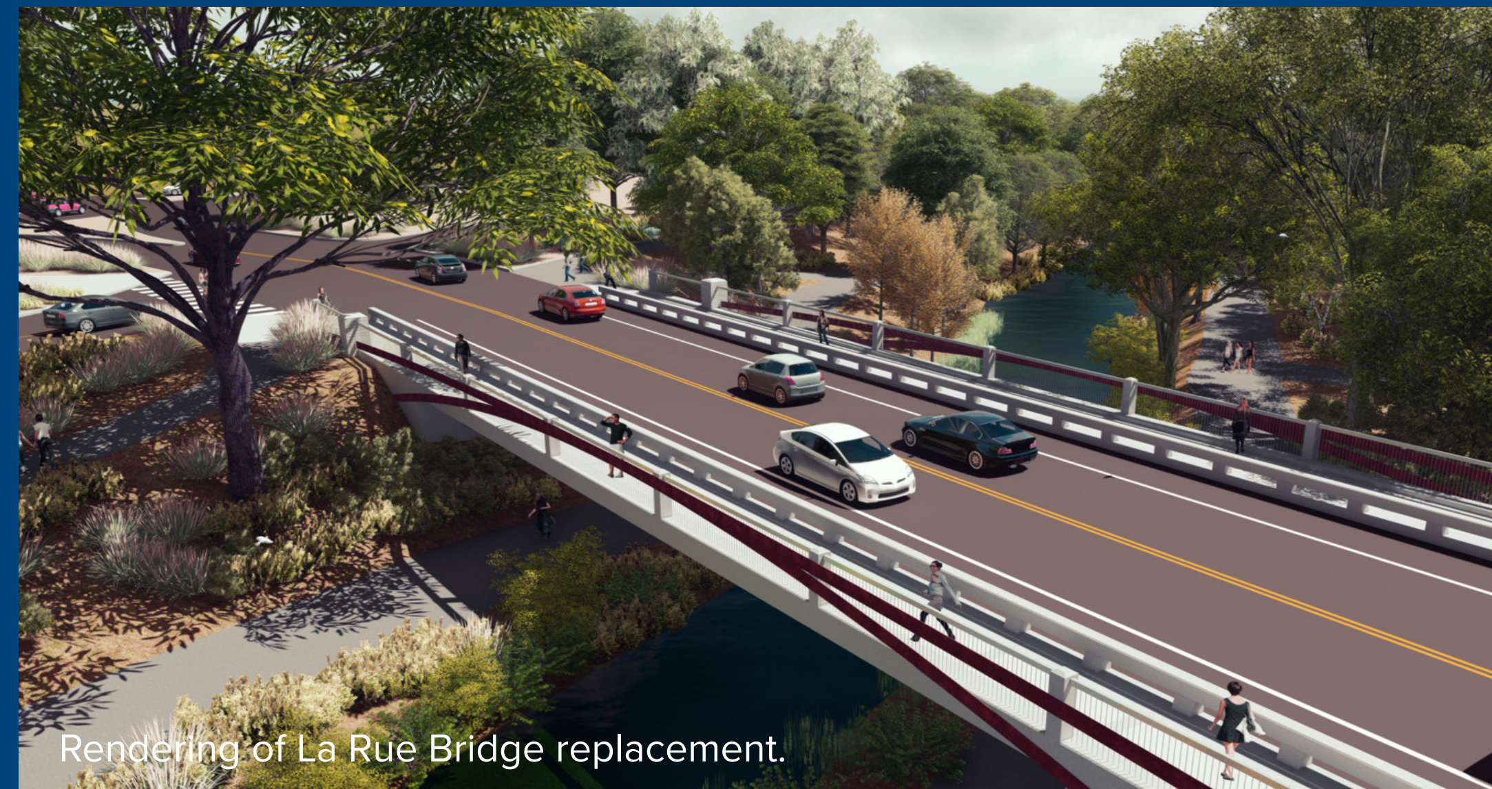
Rendering of La Rue Bridge replacement.

To safely accommodate the increasing number of cars, bikes and pedestrians going to and from the expanding Gateway District, this project – majority-funded by the Federal Highway Administration – replaces this 32-foot-wide, almost-70-year-old bridge with a seismically safe, 52-foot-wide span including standard sidewalks and bike lanes. The project also includes the relocation of utility lines and multiple improvements to the Arboretum, including safer accessible path connections and irrigation upgrades.